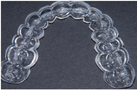
Figure 2: Carbamide peroxide bleaching gel is placed into the middle of the tray

Furthermore, elderly patients who have difficulty holding a toothbrush may find it easier to apply the carbamide peroxide gel and place this in the mouth overnight.