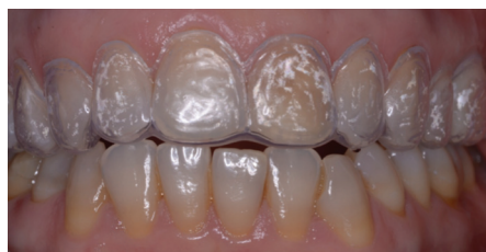
Figure 5: A patient with the upper bleaching tray in place. This treatment involved whitening followed by placement of chlorhexidine gel inside the tray after completing the crown lengthening surgery undertaken for the upper left first molar. The bleaching tray was placed after surgery to help heal the palatal area

which raises to a value of about pH 8 due to the liberation of urea. The urea and ammonia are byproducts of the breakdown process of the carbamide peroxide. Hydrogen peroxide breaks down to water and oxygen.