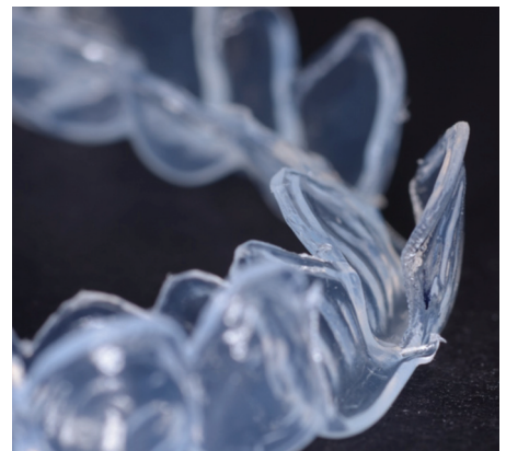
Figure 6: Close-up cross-section of the therapeutic tray for placement of various materials for different purposes