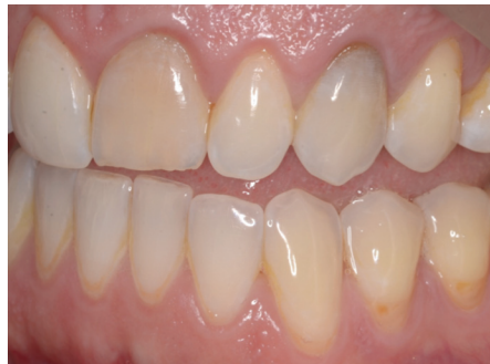
Figure 3: Early root caries in a patient who also wants to whiten his teeth. See the early root decay on the lower left first and second premolars. The patient's brushing techniques were revised and after completing the whitening treatment, the patient continued to use the tray twice a week placing amorphous calcium phosphate inside to reduce the demineralisation on the root surfaces

The research from Leonard et al 1994 has shown that when saliva comes in contact with carbamide peroxide there is an elevation in pH,