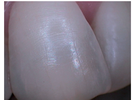
Fig. 2 Right maxillary central incisor showing the rough surface texture of the tooth following the application of the chlorine dioxide

Bleaching efficacy can be influenced by patient factors (for example, age, gender and initial tooth colour), the bleaching material used (for example, type of peroxide compound, peroxide concentration and other ingredients), and application method (for example, contact time, application frequency, enamel prophylaxis before bleaching treatment). These factors not only contribute to the bleaching