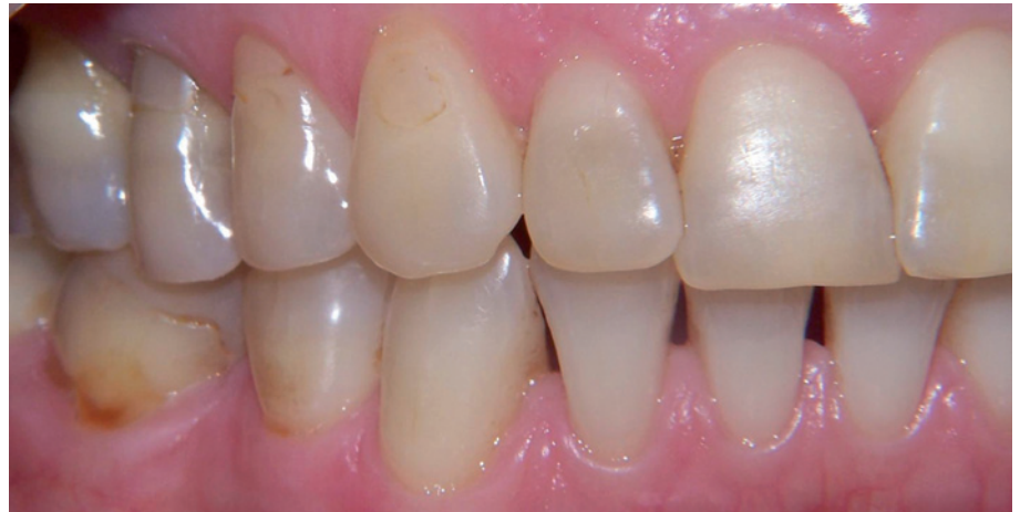
Fig. 1 Right side of maxillary teeth of a patient who had teeth whitened on a cruise using chlorine dioxide based materials

While tooth bleaching has become popular and millions of people have received the treatment during the last two decades, the mechanisms of tooth bleaching remain yet to be fully understood. 6,10 The