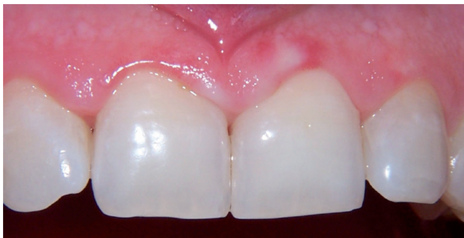
Fig. 3 Tissue burn which the patient experienced as a result of the contact of gel to gingival tissue during the power bleaching procedure

there were safety concerns with potential systemic adverse effects if the bleaching gel were to be ingested as well as local adverse effects on enamel, pulp and gingiva because of the direct contact of the gel with the tissues. 4,17–19 The safety controversies over the peroxide-based tooth bleaching prompted not only scientific deliberations but also legal challenges to their use in dentistry. 4,6,18–20