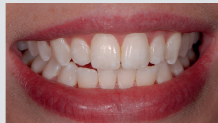
Figure 2: Result after whitening with carbamide peroxide for eight to 10 weeks

advised his patients to use peroxy mouthwash into the retainer to reduce the gingival hyperplasia (Haywood, 1991a). At the six-month recalls he noted that not only were the gingivae of the patient significantly better, but the teeth were also whiter.