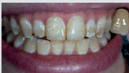
Figure 1: An advanced whitening case with a diagnosis of fluorosis. The patient had direct composite bondings placed over the upper central incisor teeth to mask the discolouration, which were removed prior to whitening. Home bleaching was undertaken using 10% carbamide peroxide in a bleaching tray

Correctly answering the questions on page 66, worth one hour of verifiable CPD, will demonstrate that the reader understands how tooth whitening has become a valued treatment service for patients with a vast body of scientific literature behind it.