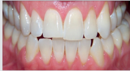
Figure 4: The result after whitening for six weeks with home bleaching trays for six weeks using 10% carbamide peroxide whitening gel

the course of the weekend. The patient was to return at the end of the weekend and the access cavity disinfected and cleaned and the pulp chamber restored with glass ionomer.