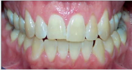
Figure 3: This patient had a basic inherent grey shade to his teeth